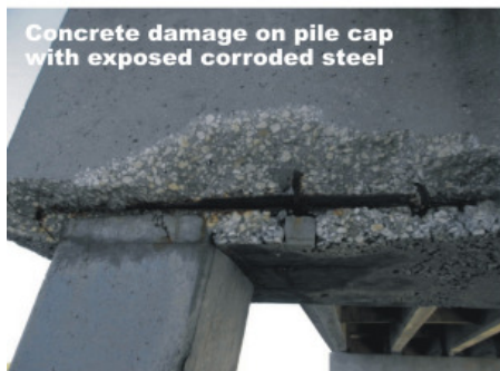
Concrete damage on pile cap with exposed corroded steel