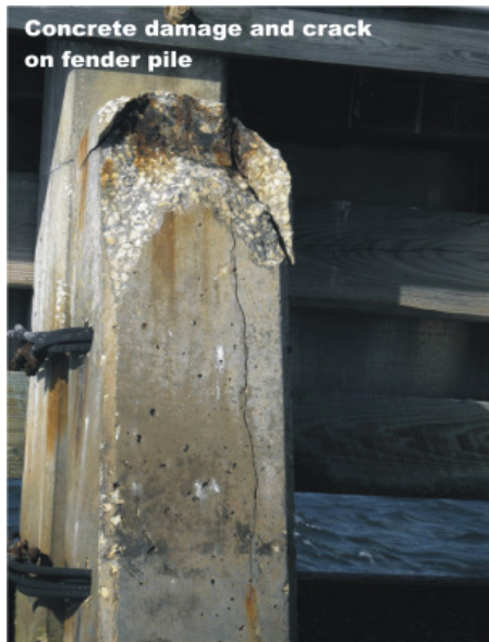
Concrete damage and crack on fender pile