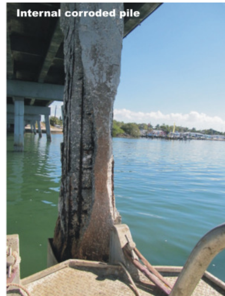
Internal corroded pile