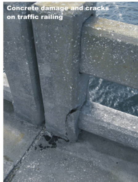
Concrete damage and cracks on traffic railing