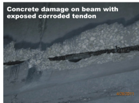
Concrete damage on beam with exposed corroded tendon