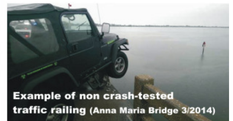
Example of non crash-tested traffic railing (Anna Maria Bridge 3/2014)