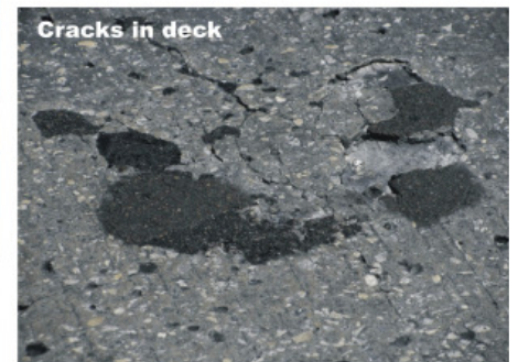
Cracks in deck