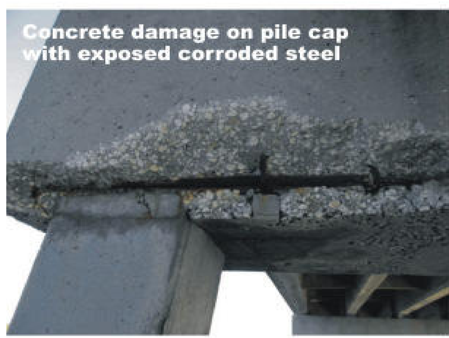
Concrete damage on pile cap with exposed corroded steel