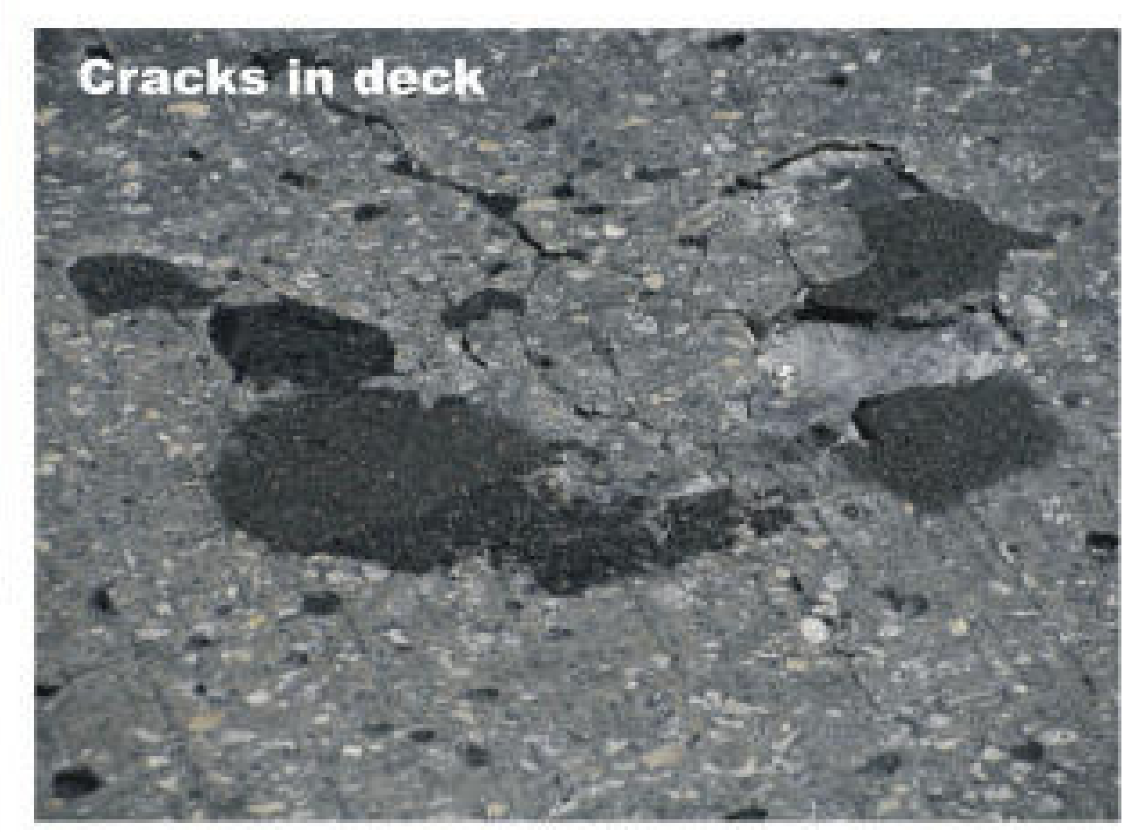
Cracks in deck