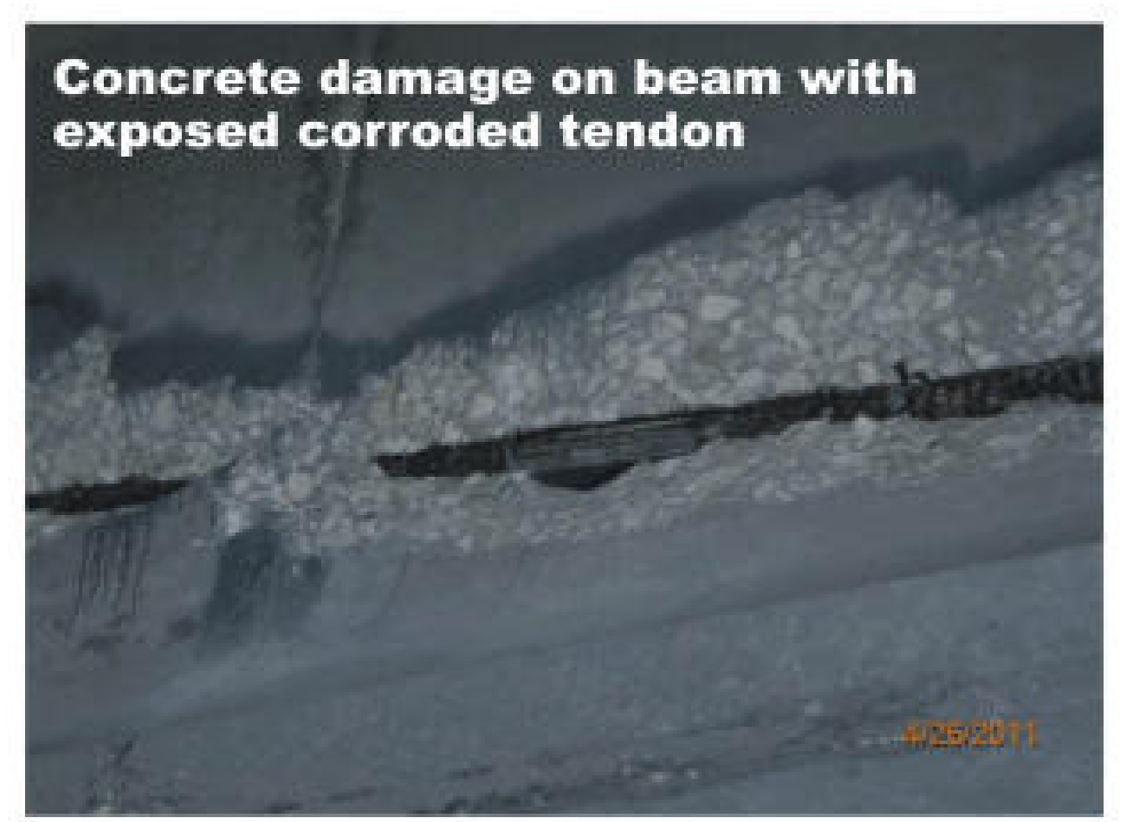
Concrete damage on beam with exposed corroded tendon