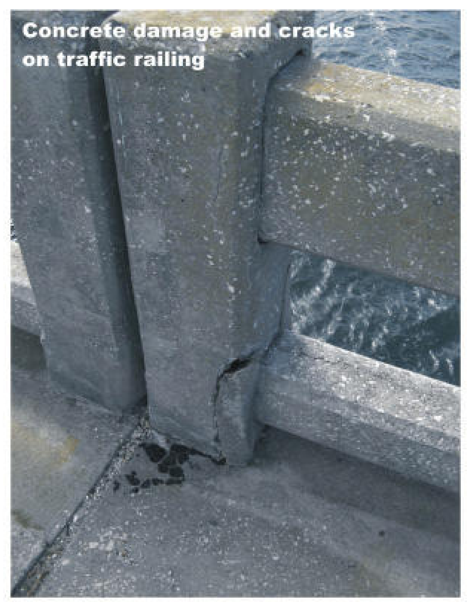
Concrete damage and cracks on traffic railing