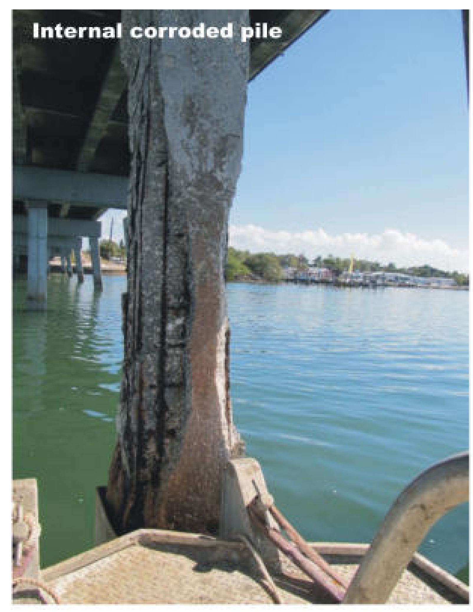
Internal corroded pile