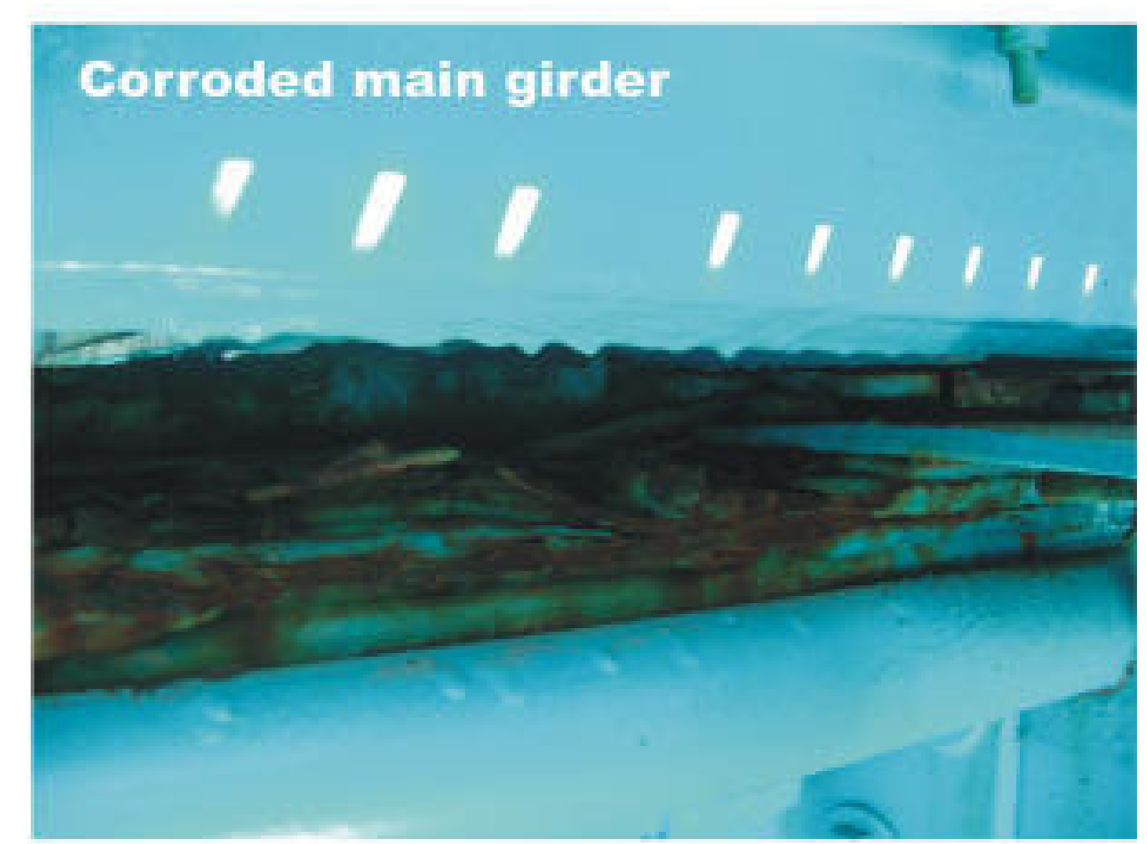
Corroded main girder