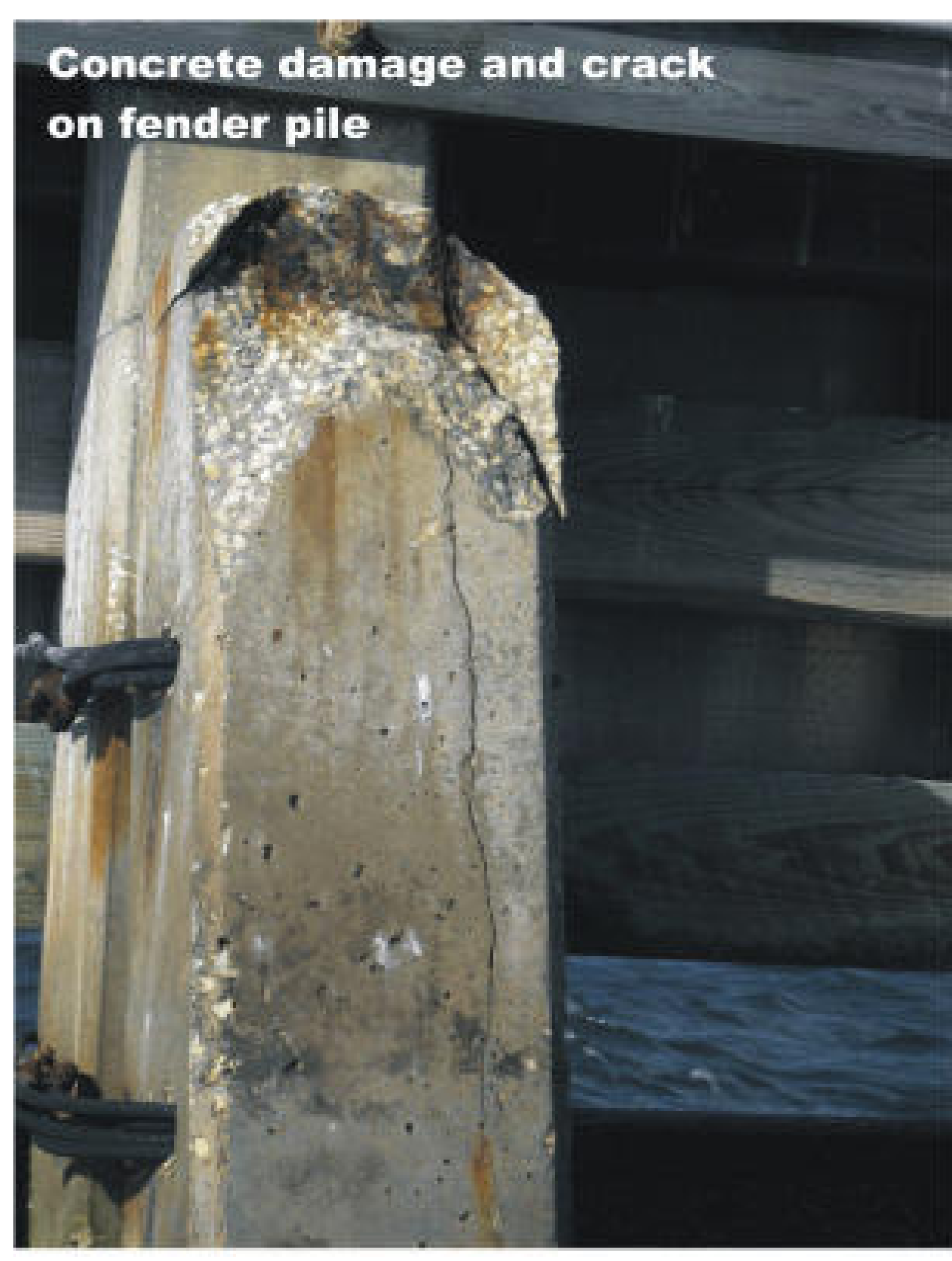
Concrete damage and crack on fender pile