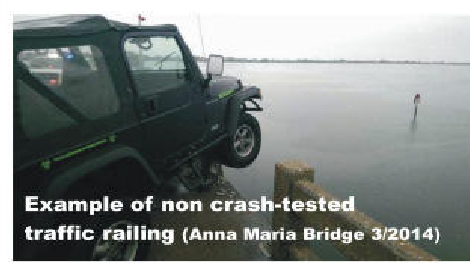
Example of non crash-tested traffic railing (Anna Maria Bridge 3/2014)